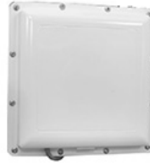
UHF Fixed Reader Winmate Part Number:9B000000008L Able to scan long distance tag, able to both FM08 & 10